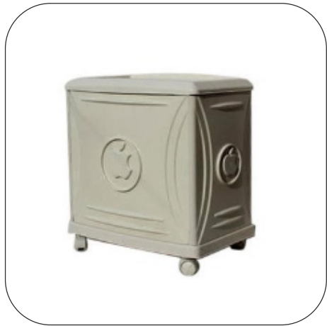
White Tall Tubular Inverter Battery Trolley