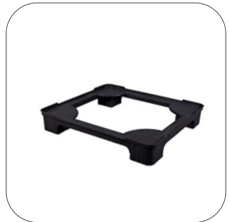
Small Fridge Stand