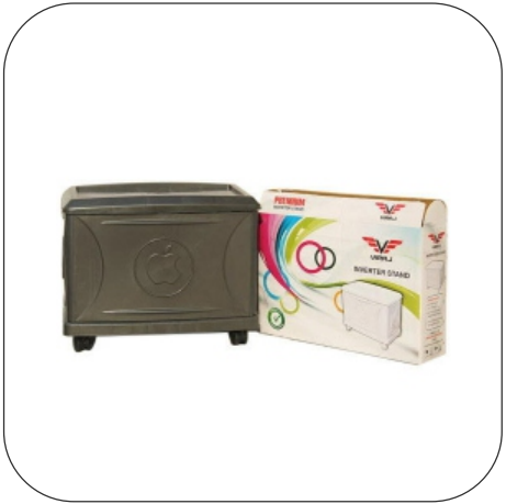
Grey Inverter Single Battery Trolley