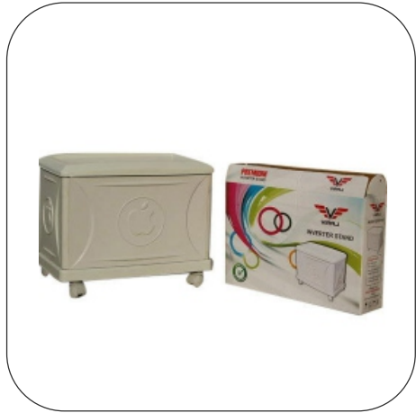
White Inverter Single Battery Trolley