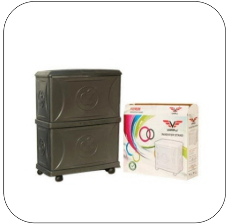
Viraj Inverter Double Battery Trolley