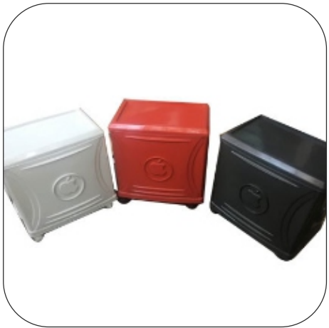
Tubular Inverter Trolley