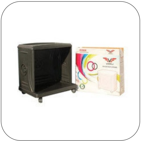
Grey Double Tall Tubular