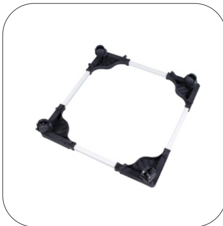
Washing Machine Stand