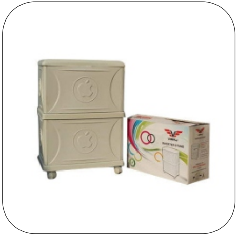
White Inverter Double Battery Trolley