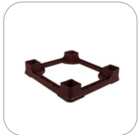
Small Fridge Stand upto 180Ltre