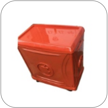
Tall Tubular Double Battery Trolley