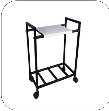
Metal Invertor Trolley