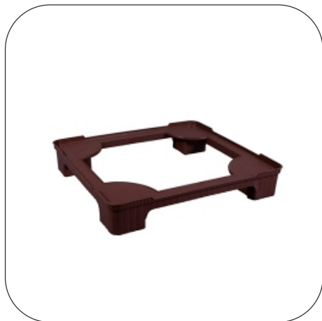
Small Fridge Stand